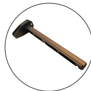
Optional Buttstock – One pound lighter than normal buttstock